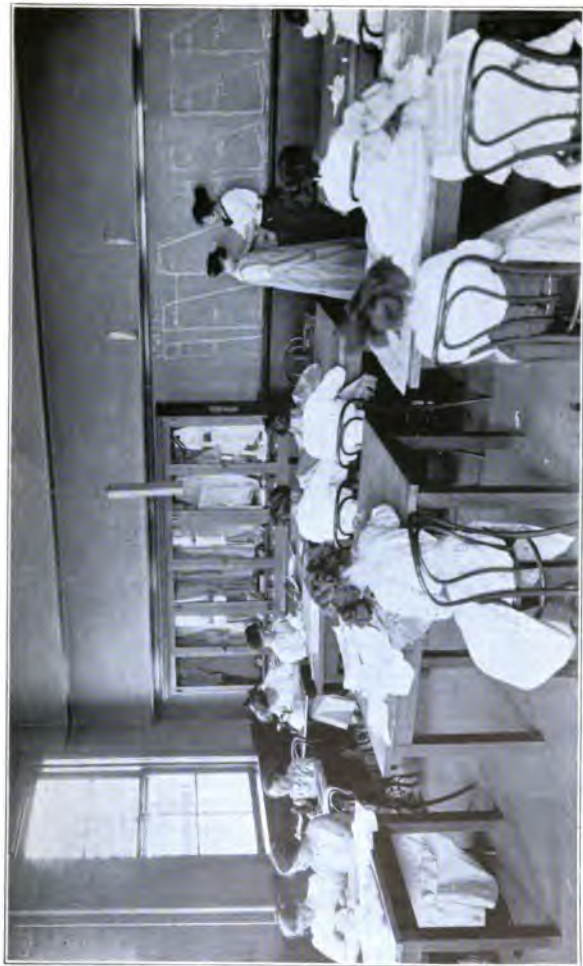
One of the several sewing centers in elementary schools